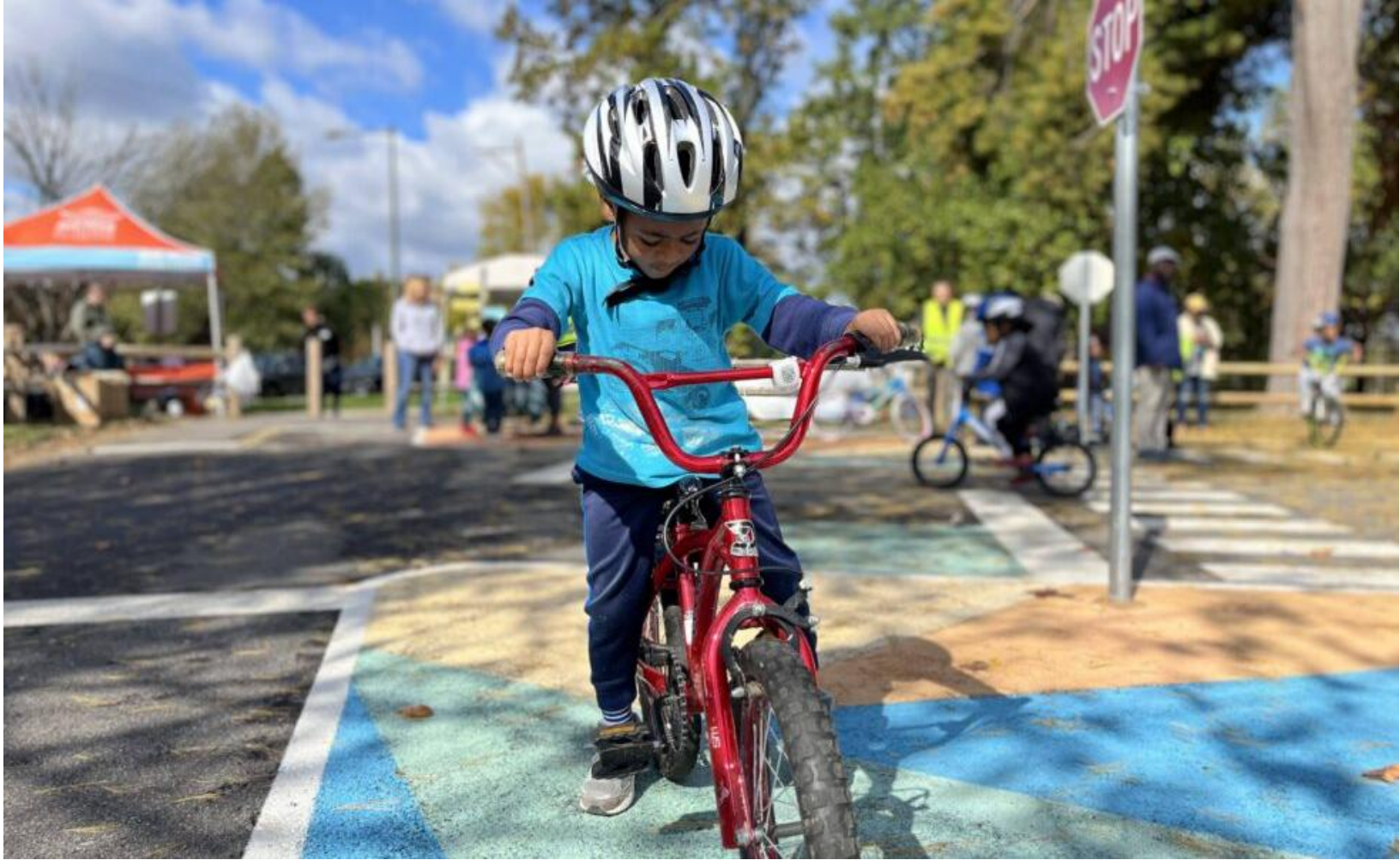
Hunting Park Lil Safety Village