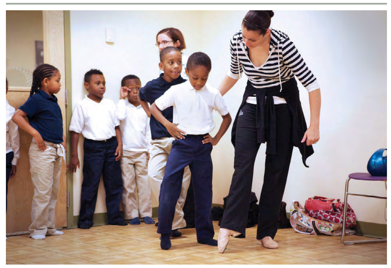
ROCK SCHOOL FOR DANCE EDUCATION

When young people are placed 'at risk' by poverty, they often lack the experiences and opportunities that might foster socioemotional learning, such as sustained relationships with trusted adults outside their families, quality informal learning situations, experiences that consistently challenge them to excel, and safe environments in which to explore. Through no fault of their own, these students have fewer opportunities to acquire a set of skills that are critically important for success in school and life, including the ability to manage behavior and make effective decisions, strategies to form and maintain a positive self-concept, and the capacity to interact productively with others.