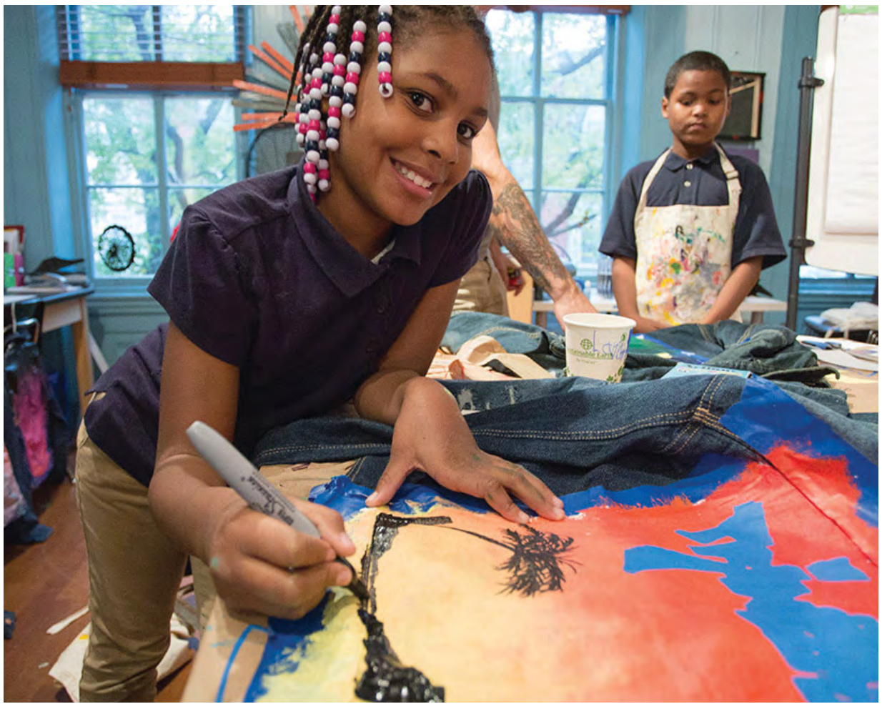
MURAL ARTS PHILADELPHIA

Students, teachers, and schools from across Philadelphia contributed their time and energy to this study, while administrators and teaching artists displayed patience and flexibility in allowing information to be collected about their programs. This collective effort has generated new information about the value of the arts, and new ways to understand what arts education may offer to children and youth.