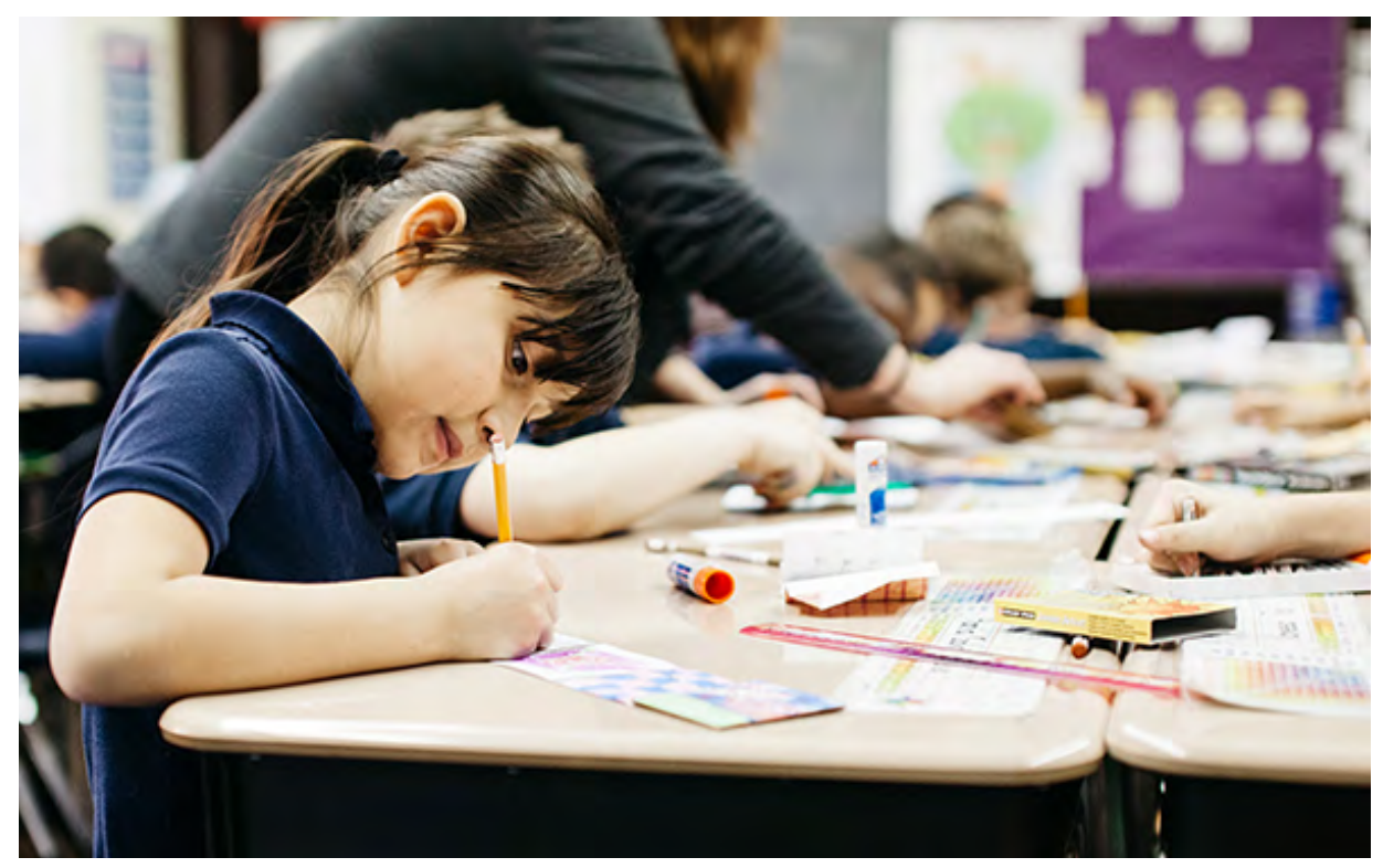
SAMUEL S. FLEISHER ART MEMORIAL

To examine the impact of arts learning on students' socioemotional development, we first had to define socioemotional learning in the context of this study. We began by reviewing the research literature on the relationship between arts education and socioemotional development. Then we held conversations with the leadership of arts education programs, in which we asked about the specific domains of socioemotional development that they believed their programs were most likely to influence. Based on these conversations, we developed a list of socioemotional domains that might be unique to the experience of arts education—as opposed to those that could result from extra-curricular activities more broadly, such as athletics—but that were not likely to be specific to a single arts discipline.